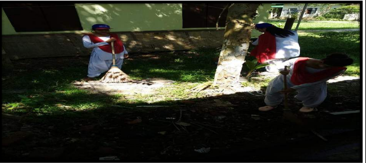
5 Enviornment Awareness Meeting