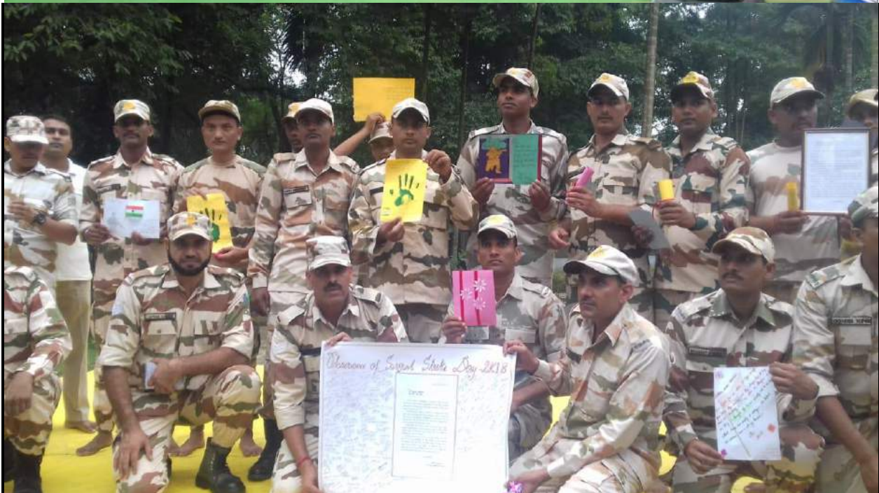
16. Disaster Management awareness Programme